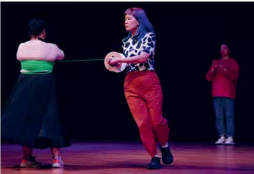
«FLOATING ROOTS» INKY LEE PERFORMANCE