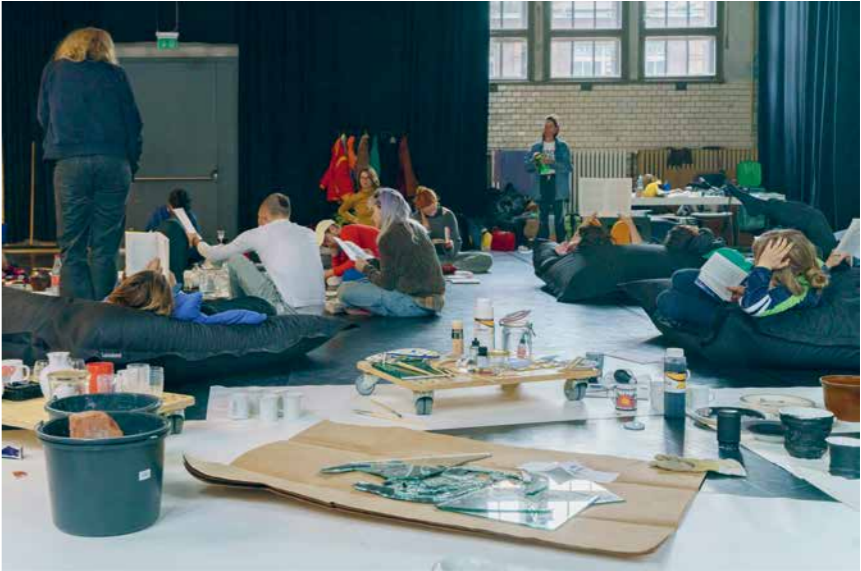
«(IM)MOBILITY SALON #1: INSTITUTE OF REST(S) MEETS TANZFABRIK» ALIX EYNAUDI