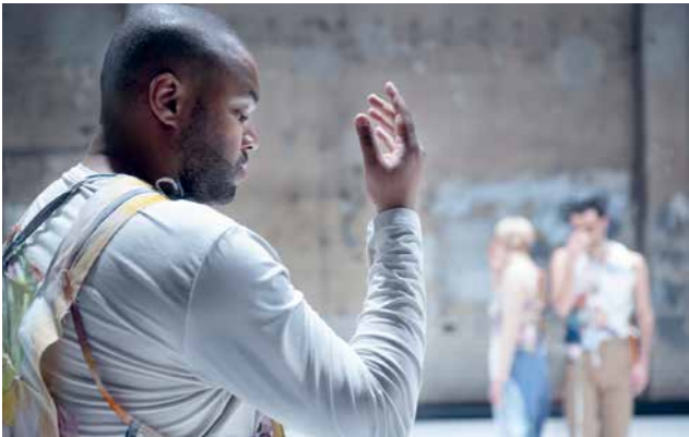
«SHIRAZ» ARMIN HOKMI PERFORMANCE